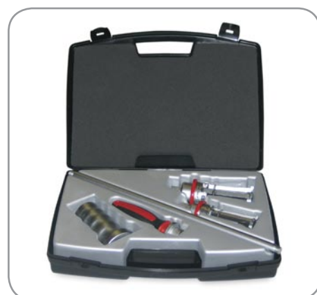
TMIP 30-60 Supplied with 2 extractors covering bore diameters from 30 to 60 mm (1,2 to 2,4 in)