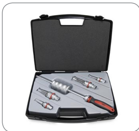
TMIP 7-28 Supplied with 4 extractors covering bore diameters from 7 to 28 mm (0,28 to 1,1 in)