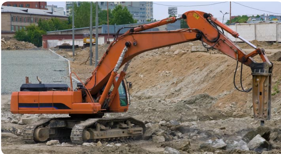
Replacing manual lubrication with a SKF Hydraulic Driven Lubricator pays off big for a demolition company.

The whole idea behind the SKF 360° Solution programme is to help you get more out of your construction equipment. Whether your goals include increasing availability, lowering maintenance costs or improving safety, SKF can support you. Here is an example of the SKF 360° Solution programme in a construction application.