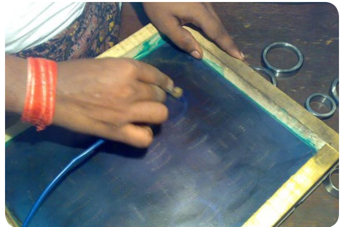
False markings are etched on bearings using silk screens such as this.