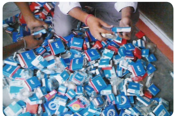
Counterfeit bearings confiscated during a police raid.