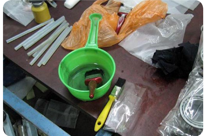
Typical tools used in a counterfeit workshop.

Instead of getting a premium quality product, you end up purchasing a poor quality product for a price much higher than it is worth.