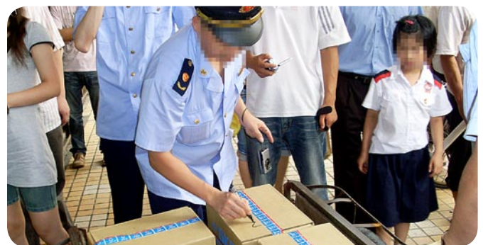
Police raids take place when enough evidence is collected.